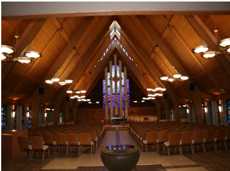
GRACE EVANGELICAL LUTHERAN CHURCH

Following several years of research, discussion and consideration the Congregation voted in September 2016 to affiliate with The North American Lutheran Church.