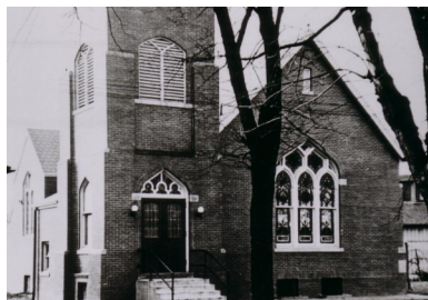
(Renovated church 1936)

Early in 1936 the membership of Grace elected to support a remodeling program for the current church as well as provide improved and enlarged space. A building fund had been started in 1921 in anticipation of a later need for the growing congregation. A cornerstone for the remodeled building was placed on July 19, 1936, with Grace now a separate congregation from St. Paul. A new bell tower and completely redecorated interior were included in the project. Dedication was October 18, 1936. A family Luther League was organized and in 1944 was restructured for youth of confirmation age and older.