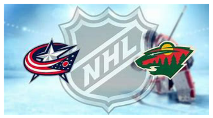
The Puck Drops at 7 p.m.

A Youth and Family group is headed to Nationwide Arena on Saturday, January 6 to see the Blue Jackets take on the Minnesota Wild. We have great seats on the Mezzanine level.